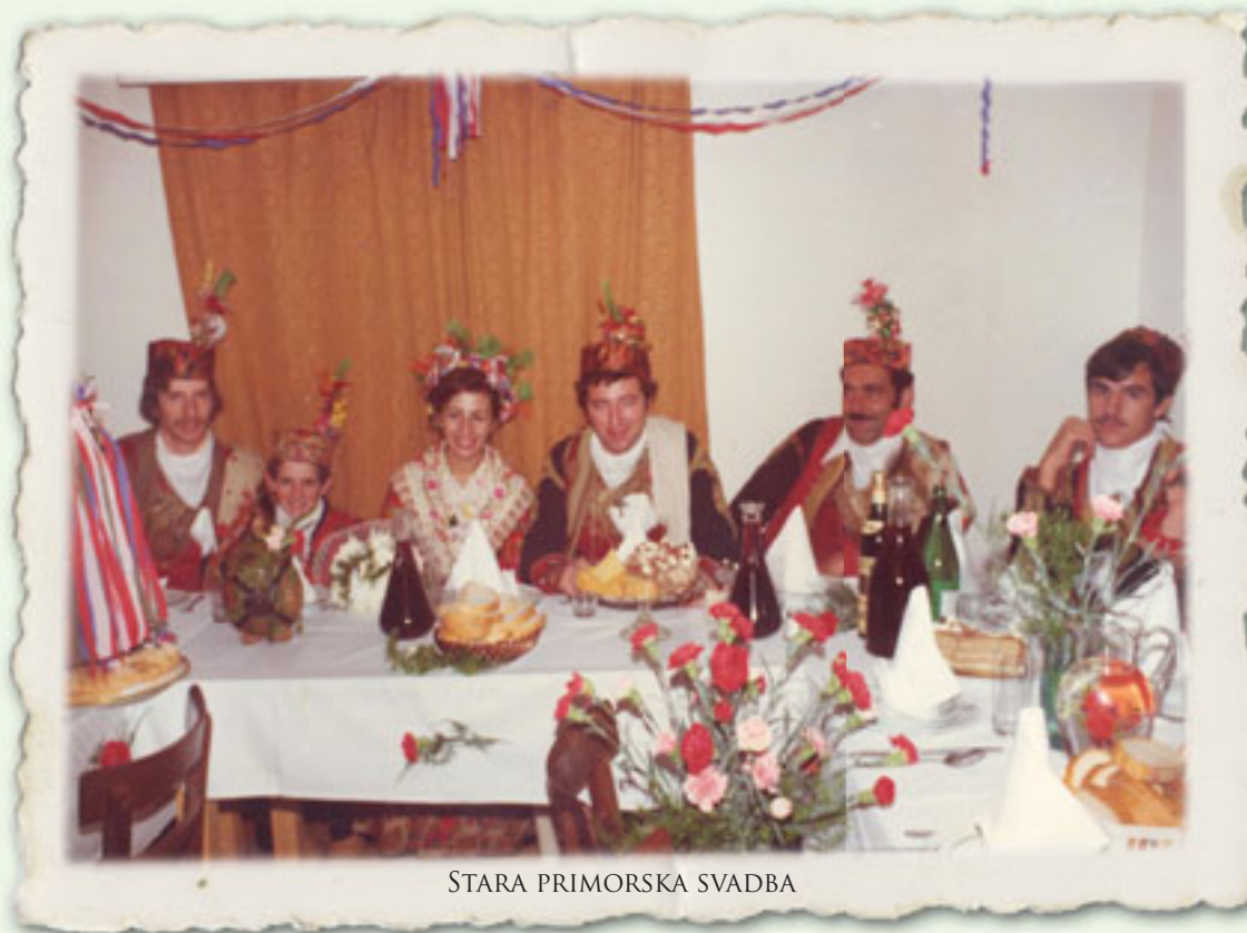
STARA PRIMORSKA SVADBA